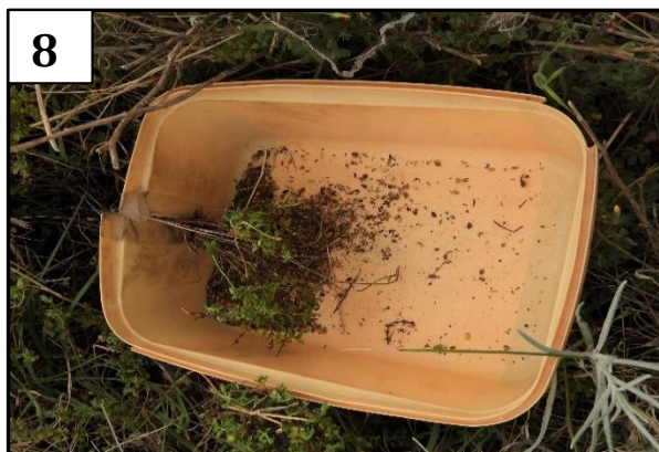
Figure 7 & 8 – Using a container to harvest seed from P. spinescens .