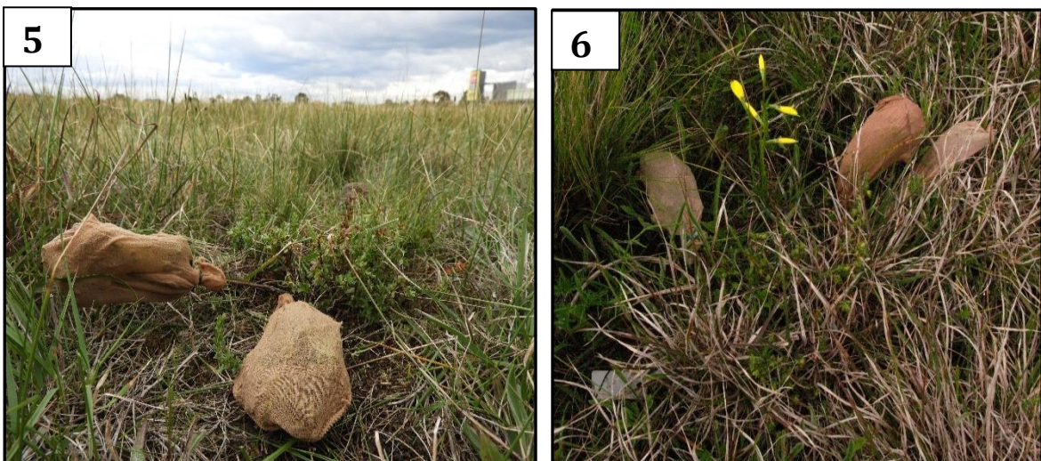
Figure 5 & 6 – Stocking seed collection bags on P. spinescens in the field.

Using plastic coated wire/string/wool to tie-off the open end at the base of the branch or at a convenient location to capture the largest amount of seed possible (Figures 5 & 6).