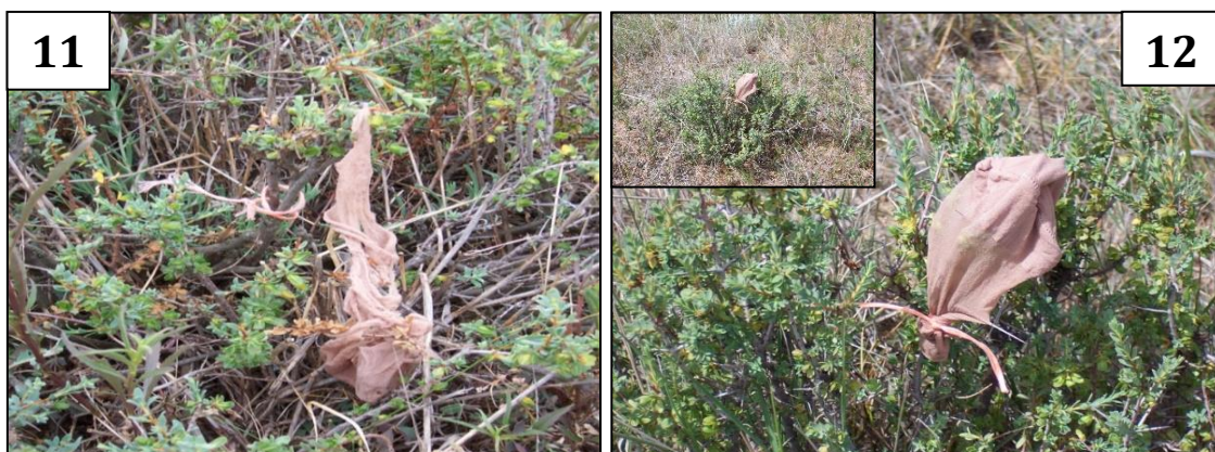
Figure 11 & 12 – Ripped stockings caused by cattle browsing.

Be wary of collecting from sites that may be subject to grazing by domestic stock, or from roadsides where stock movement is a regular occurrence. Sheep and cattle may remove or tear the stockings, trample the pin flags and the plant you are collecting from (Figures 11 & 12).