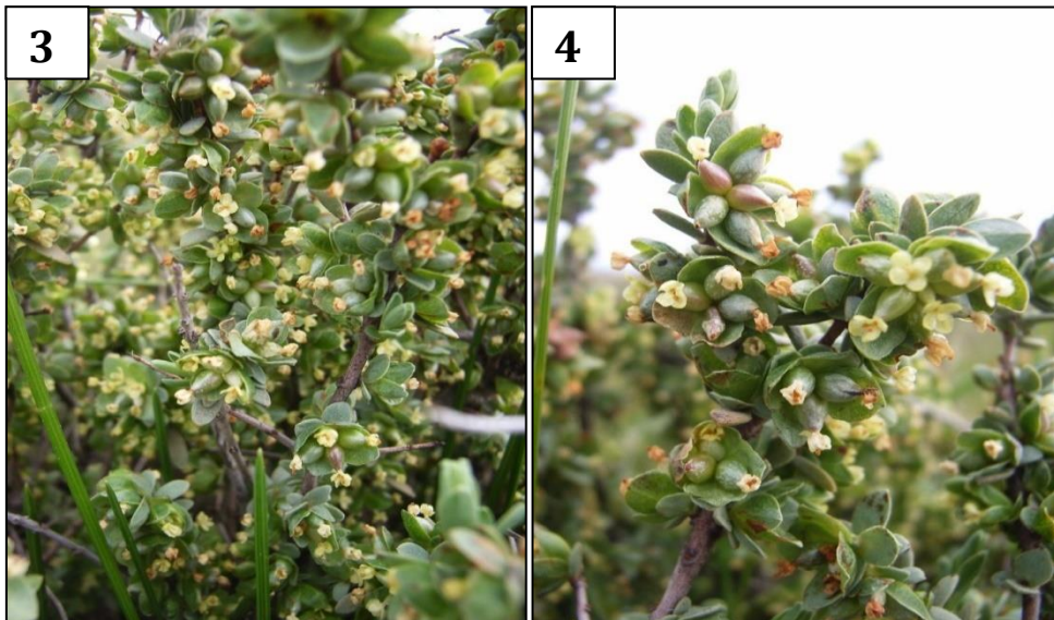
Figures 3 & 4 Ripening seed, ready for the harvesting process.

Choose a predominantly female plant that has been well pollinated and appears to have individual branches with copious amounts of seed developing on them. This ensures the effort put into harvesting the seed yields the greatest return. This will obviously depend on the size of the population and availability of female plants (Figures 3 & 4).