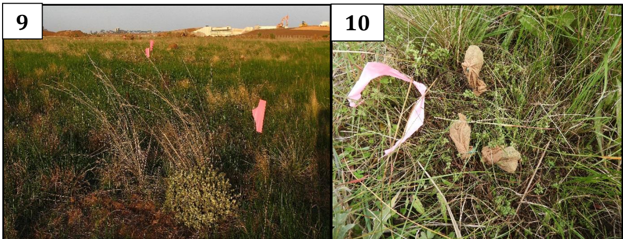
Figure 9 & 10 – Pin flag and tape marking of P. spinescens in the field.

Ensure that the plants intended for harvesting are temporarily marked in some way to ensure the plants are easily identified upon return to collect your harvest. Pin flags or attach flagging tape has proven to be sufficient previously (Figure 9 & 10).