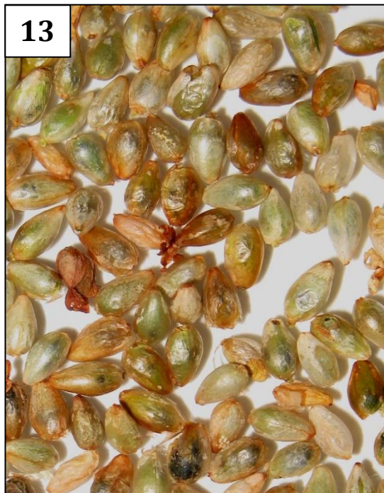
Figure 13 - Collected seed at the end of the harvesting process.

Always ensure that proper approval has been obtained, including relevant permits and landholder permission. A related translocation, introduction or augmentation plan should always be produced before seed collection begins, outlining the purpose and intended outcomes of collecting Pimelea spinescens seed.