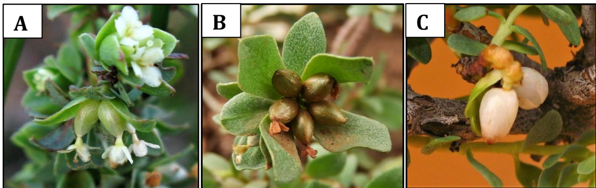
Figure 1A - Developing seed, photo taken early May.

Pimelea spinescens sbsp. spinescens (Spiny Rice-flower) generally flowers between the months of May and August. At sites around Melbourne, flowers and seed have been seen as early as April. Soon after flowering commences the ovary of female flowers starts to swell and the seed begins to develop (Figure 1A). Over time the seeds become a brown colour (Figure 1B) and sometimes, in high-rainfall seasons, they may become white (Figure 1C). Depending on local conditions and if the plant is observed to have seed, late July to August is the best time to start the seed harvesting process. This time frame will vary depending on the local conditions (rainfall, temperatures) and should be used as a guide only.